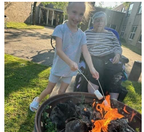
Our residents enjoyed roasting marshmallows for smores in our courtyard!