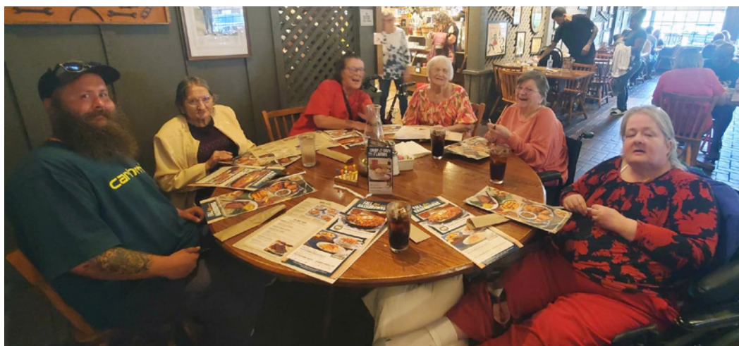
Our residents and staff enjoyed a fun lunch outing to Cracker Barrel!