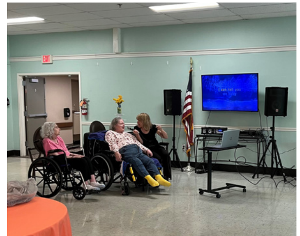
Our residents took to the stage and put on their own performance thanks to our therapy department's karaoke show!