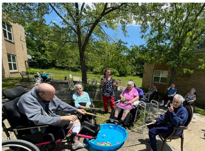
We had a beautiful day out in the sun on our patio where residents and staff enjoyed fishing games during our cookout.