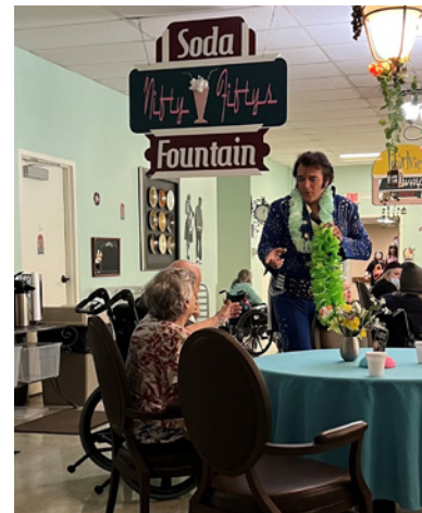
Our residents traveled back in time and enjoyed a personal concert from the King of Rock & Roll, Elvis!